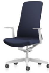
Swivel chair, upholstered backrest

PURE IS3 fits perfectly into any environment. Its clean-cut design and the large choice of colours and materials leave you free to customise your chair. The collection offers four swivel chair models: a mesh or upholstered backrest in either white or black. A variety of materials and colours are available to choose from. The Smart Spring, chair column and optional armrests are available in either all-white or all-black for all models. Choose between fixed T-armrests or 3D T-armrests; the fixed T-armrest impresses with its slim design, while the 3D T-armrest is exceptionally functional and height-, width- and depth-adjustable.