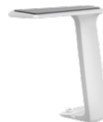
Fixed T-armrest, white

• As standard ◦ Optional - Not available