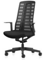
Swivel chair, mesh-covered backrest