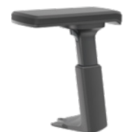
3D T-armrest, black