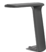
Fixed T-armrest, black