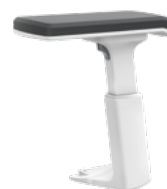
3D T-armrest, white